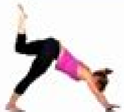
Knee circles (step 2)