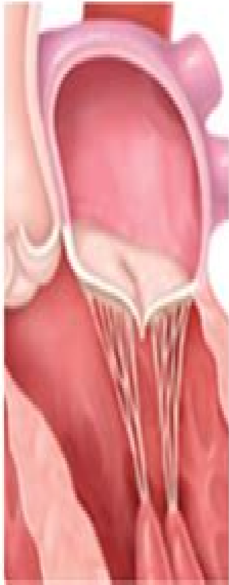
Normal mitral valve