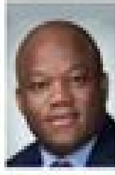
MR SIHLE ZIKALALA

MINISTER PUBLIC SERVICE AND ADMINISTRATION