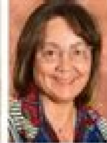
MS PATRICIA DE LILLE

MINISTER COMMUNICATIONS AND DIGITAL TECHNOLOGIES