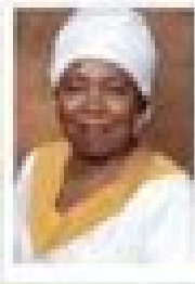
DR NKAGAZANA DLAMINI ZUMA

MINISTER THE PRESIDENCY RESPONSIBLE FOR PLANNING, MONITORING AND EVALUATION