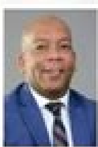
DR KGOSIETSEHO RAMOKGOPA

MINISTER THE PRESIDENCY RESPONSIBLE FOR ELECTRICITY