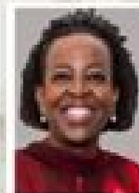
MS MAIPOENE RAMOKGOPA

MINISTER THE PRESIDENCY RESPONSIBLE FOR PLANNING, MONITORING AND EVALUATION