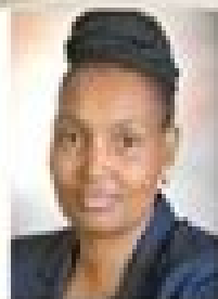
MS THEMBI NKADIMENG

MINISTER CO-OPERATIVE GOVERNANCE AND TRADITIONAL AFFAIRS