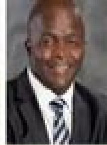
MR MONDLI GUNGUBELE

MINISTER COMMUNICATIONS AND DIGITAL TECHNOLOGIES