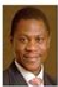
MR PALE MASHATILE

MINISTER THE PRESIDENCY RESPONSIBLE FOR ELECTRICITY