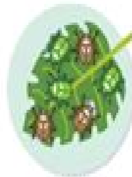
3. Geoplia parva 4. Cetiosaurus