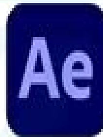
Adobe After Effects