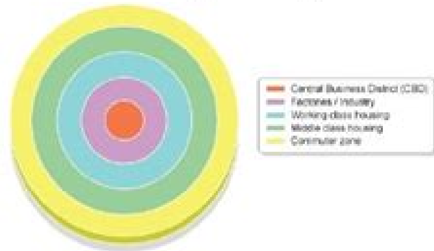
Burgess or concentric zone model