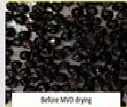
Before MVD drying