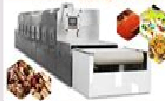
Microwave drying machine