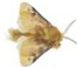
Southern Flannel Moth