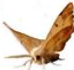
Venezuelan Poodle Moth