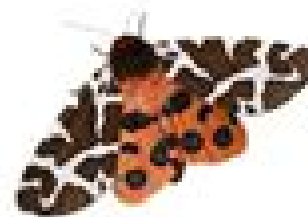
Garden Tiger Moth