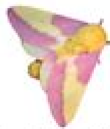
Rosy Maple Moth