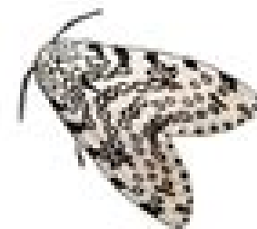
Giant Leopard Moth