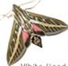
White-lined Sphinx Moth