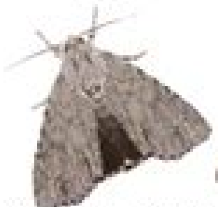
American Dagger Moth