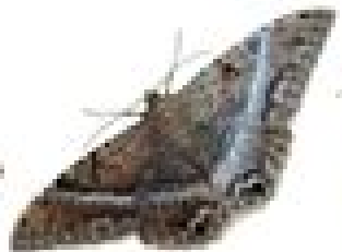
Black Witch Moth