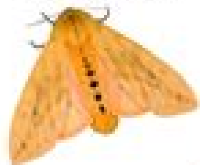
Isabella Tiger Moth