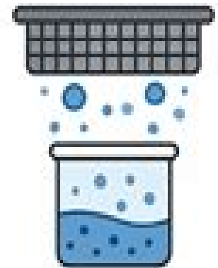
Sieving and Sedimentation