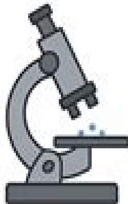
Optical and Electron Microscopy