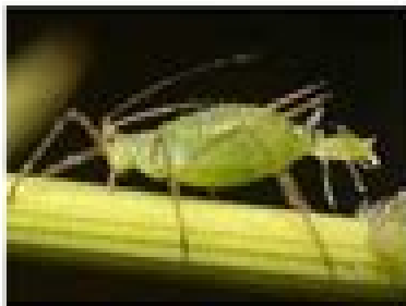
Aphids and Ants