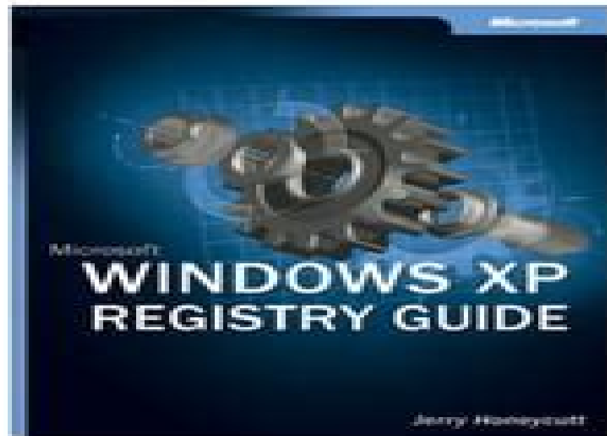
Microsoft Windows XP Registry Guide