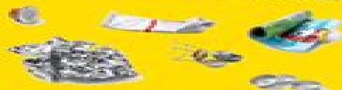
TOUS LES AUTRES EMBALLAGES EN MÉTAL