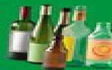
BOUTEILLES EN VERRE