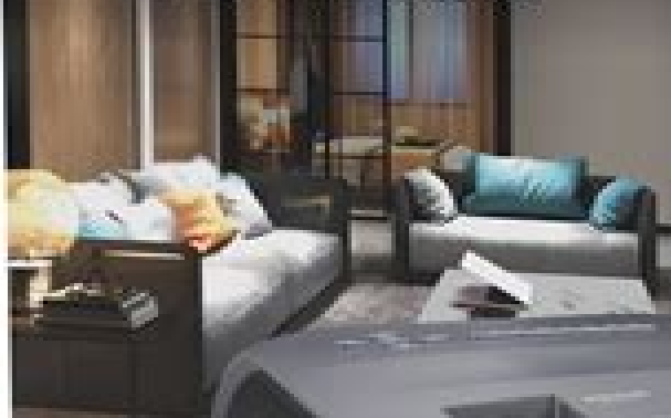
IMAGE STREAM+ WIRELESS 1080P FHD TFT LCD PROJECTOR KIT WITH 120" PORTABLE PROJECTION SCREEN