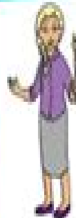
day care teacher