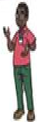
elementary school teacher