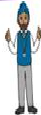
special education teacher