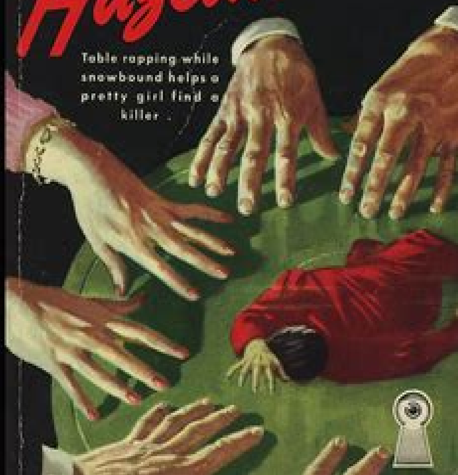
Table rapping while snowbound helps a pretty girl find a killer.