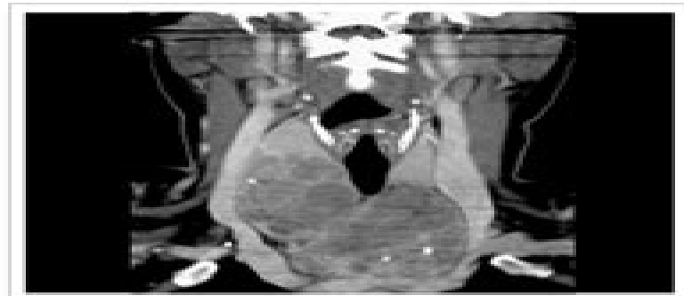
FIGURE 4: Coronal CT scan image of anterior neck triangles.