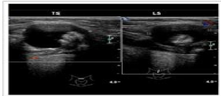
FIGURE 1: Sagittal B-mode sonar image.

A 26-year old lady presented with a painful paramedian anterior neck mass. These are her ultrasound and CT scan images.