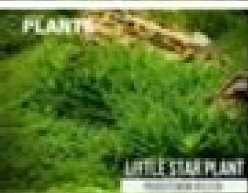
LITTLE STAR PLANT