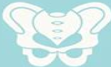
Cramping Pelvic Floor