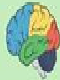
Abnormal brain structure