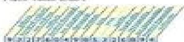
Place Value Chart

Whole numbers: 1,000,000,000 Decimals: .000,000,000