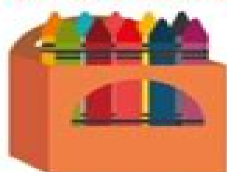
Caja de colores $28.2