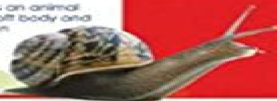
snail A snail is an animal with a soft body and a shell on its back.

A B C D E F G H I J K L M N O P Q R S T U V W X Y Z