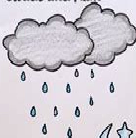
Clouds and Rain