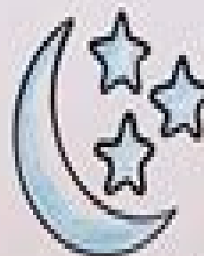
Moon and Stars