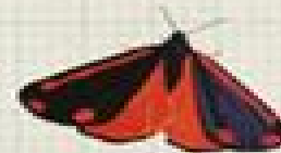
Cometary Moth ( Agrotis ypsilon )