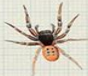
Ladybird Spider ( Arachnida ) Arachnida