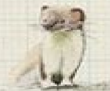
Skunk ( Meutonia erminea )