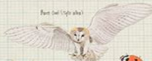
Great Horned Owl ( Bubo virginianus )