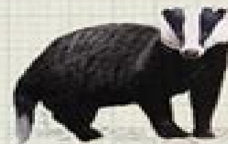
Badger ( Taxidea taxus )