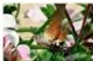
Muska domowa Musca domestica