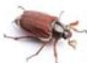
Czerwotka majowa Coccinella septempunctata