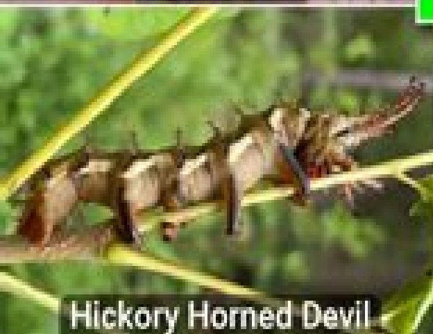
Hickory Horned Devil