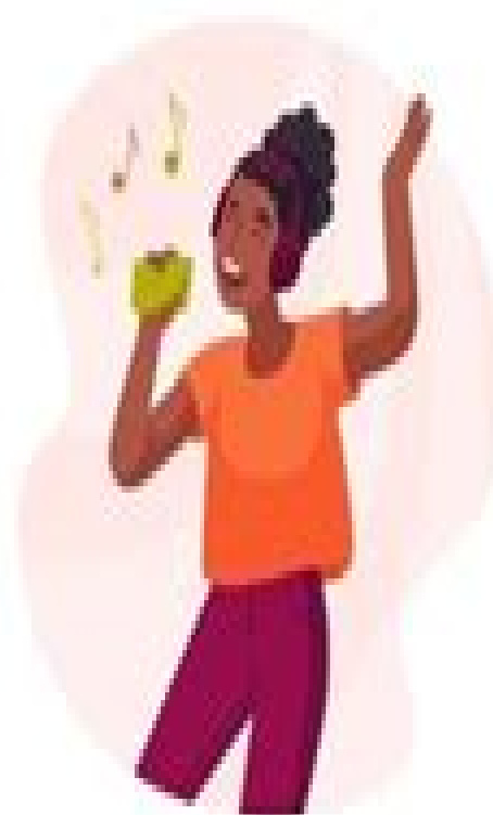
Singing favorite songs