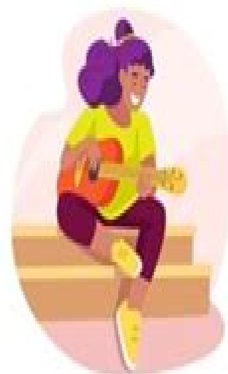
Learning to play music