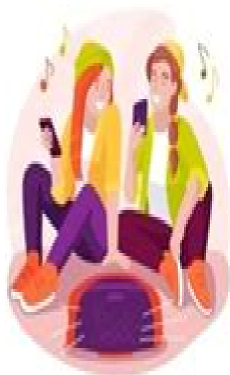
Sharing music with friends