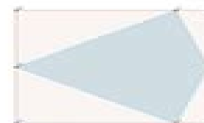
Figure 1: Statement of pre-folding

The problem was stated as “for which locations of the dynamic points A and B, the segments [OL_0] and [KL_0] intersect?” in the research (Figure 2). The mathematical concepts related to the solution can be summarized as algebraic approach, line equations, slope, point and vector in three dimensional space and scalar triple product. As a short result, it can be stated that at least one of the points A and B must be in the midpoint of the segments on which they are located after visualization in the environment of GeoGebra 5.0. It is expected that this kind of real situated activities are attractive for the students.