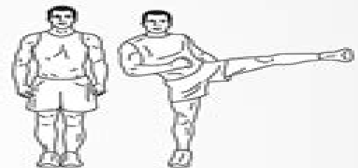
10 side leg raises