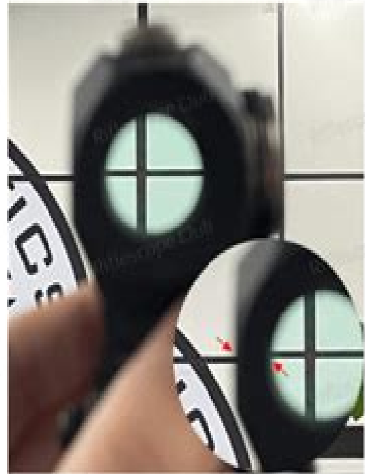
Parallax Exists (Image Shift)