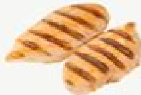
chicken breast 47 g/130 g serve