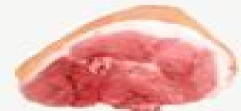
leg ham 39 g/150 g serve