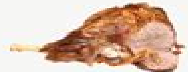
lamb roast 56 g/200 g serve