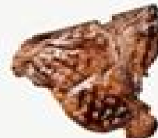
T-Bone steak 44 g/160 g serve