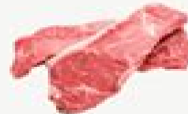
New York strip steak 62 g/175 g serve