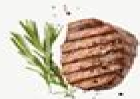
filet mignon 52 g/145 g serve