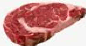
ribeye filet 69 g/220 g serve