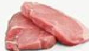
pork chops 53 g/185 g serve