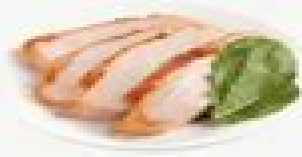
turkey breast 82 g/260 g serve