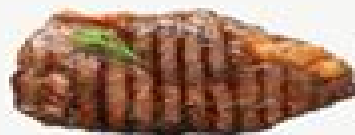
sirloin steak 53 g/180 g serve