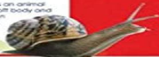
snail A snail is an animal with a soft body and a shell on its back.

A B C D E F G H I J K L M N O P Q R S T U V W X Y Z