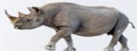
West African Black Rhinoceros