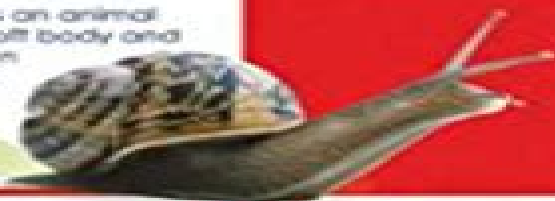
snail A snail is an animal with a soft body and a shell on its back.

A B C D E F G H I J K L M N O P Q R S T U V W X Y Z