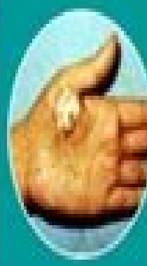
Occupational skin cancer