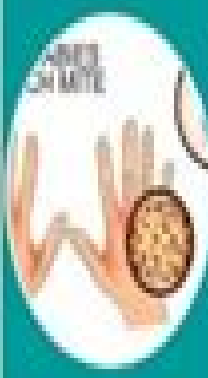
Skin infections (Scabies, Fleas)