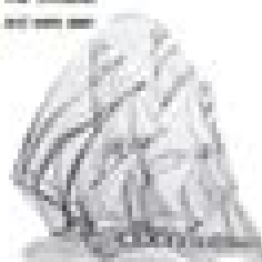
Paper only used for news.

In 1605 the earliest version of the modern newspaper appeared in Venice. These were handwritten news sheets, called news or gazettes, that circulated through major trade cities and were seen as the way to England.