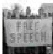
First newspaper in the United States, credit Library of Congress.

In 1687 the first newspaper published in the United States, the first English newspaper that no one could be prosecuted for criticizing the government or violating the law.