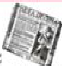
Source of the world news

From the 18th to the 19th century, there were handwritten notices, signs, and the first version of news reports called the Dutch. These publications covered politics, news, weather, education, and other undertakings.