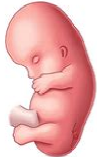
9 week fetus