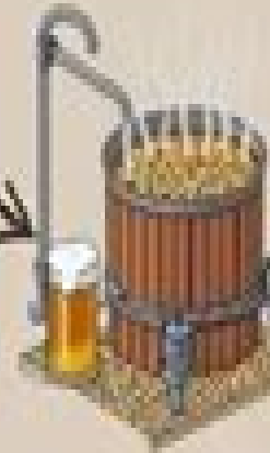
Step 3: Mashing