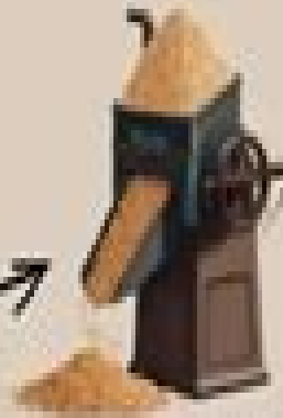
Step 2: Milling