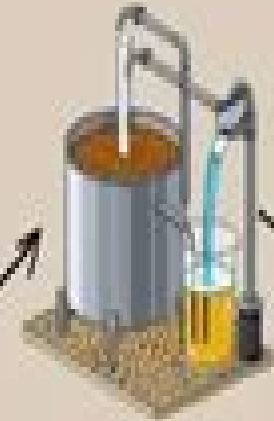
Step 4: Lautering