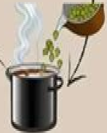
Step 5: Boiling and Hopping