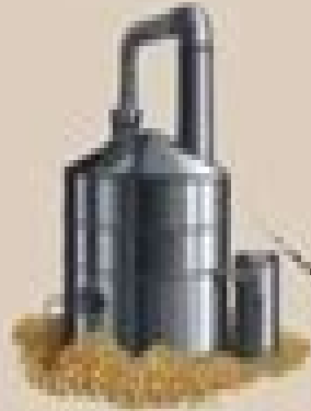
Step 1: Malting