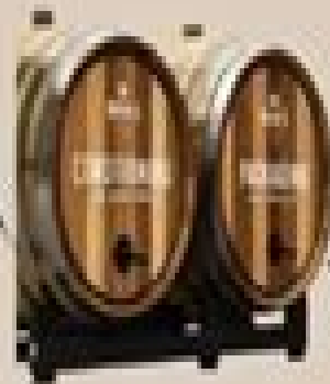
Step 7: Maturing