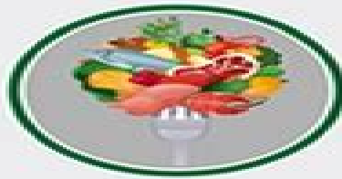
Eat Foods High in Vitamins & Minerals