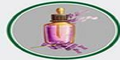
Use Essential Oil