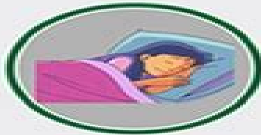
Get Enough Sleep