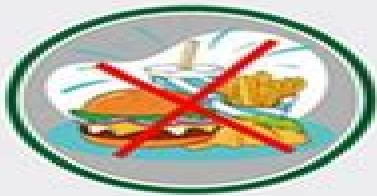
Avoid Trigger Foods