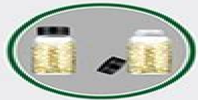
Try Natural Menopausal Supplements