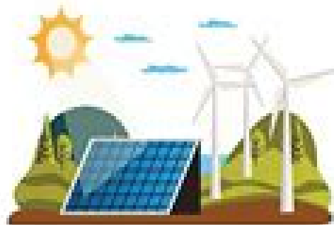
Wind Power and Solar Energy