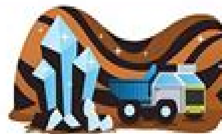
Precious Metals, Minerals, Rocks