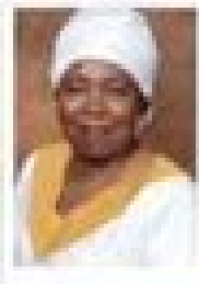
DR NKAGAZANA DLAMINI ZUMA

MINISTER THE PRESIDENCY RESPONSIBLE FOR PLANNING, MONITORING AND EVALUATION