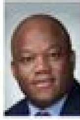
MR SIHLE ZIKALALA

MINISTER PUBLIC SERVICE AND ADMINISTRATION