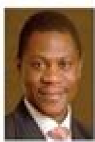
MR PAUL MASHATILE

MINISTER THE PRESIDENCY RESPONSIBLE FOR ELECTRICITY