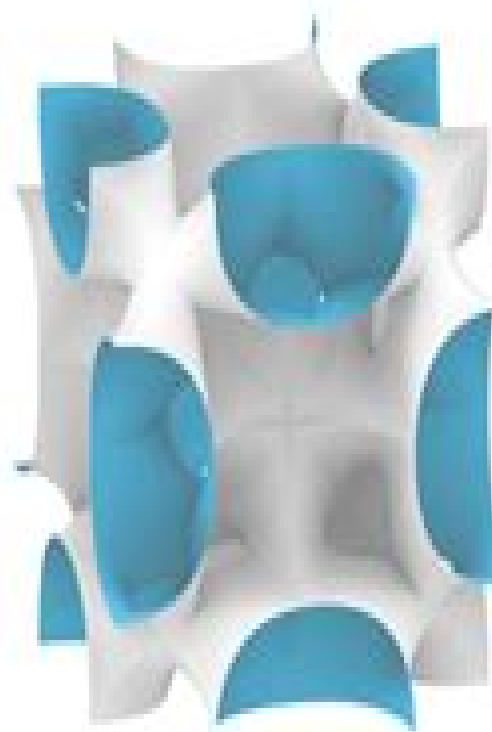
Schoen's P4-Batwing Surface