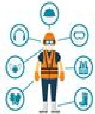
Use DIY Safety Equipment