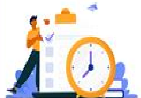
Schedule Your Task