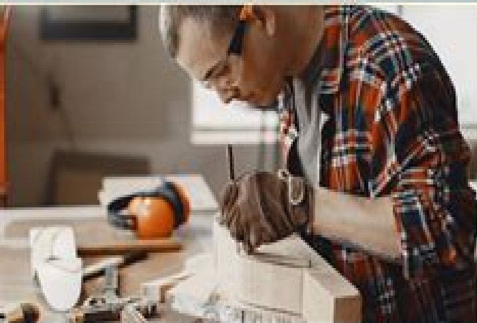
Place Your Tools On The Table Surface