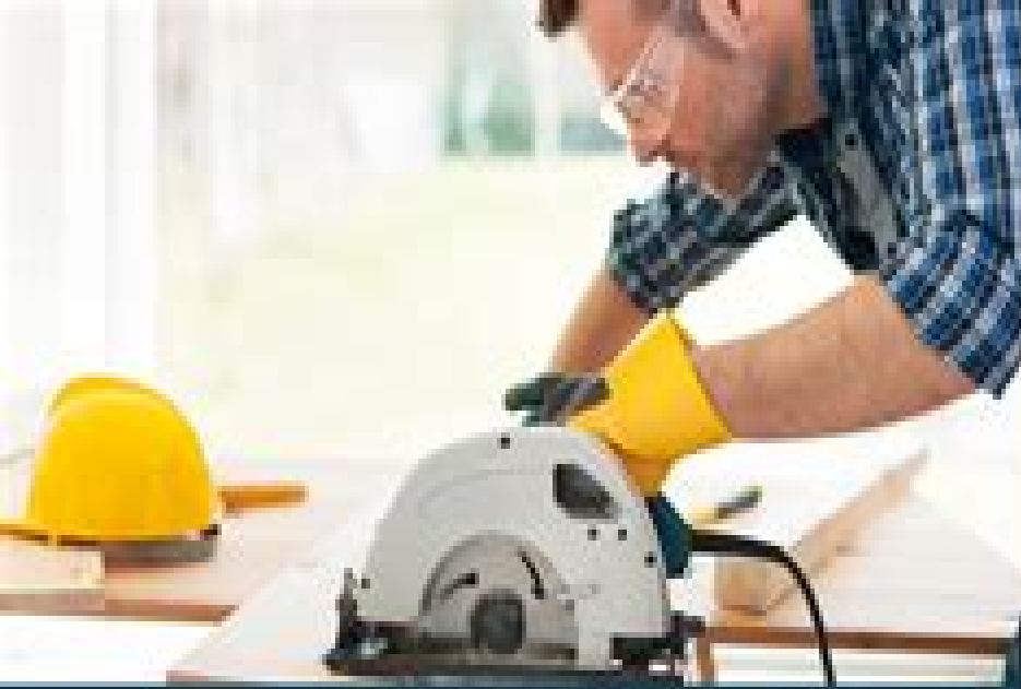
Take Extra Care While Working With Power Tools