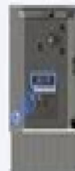
Single Room Mode