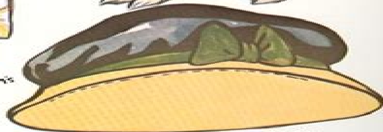
CUT ON DOTTED LINE