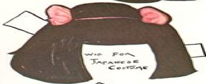
WIG FOR JAPANESE COSTUME