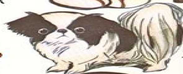
"PEEK" DOLLY'S DOGGIE