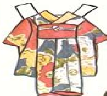
CHERRY BLOSSOM'S KIMONO