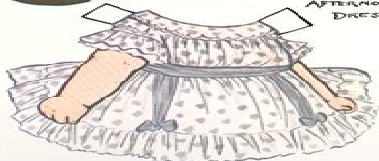
AFTERNOON DRESS -