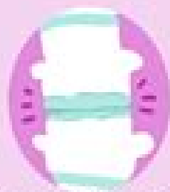
Degenerative Disc Disease