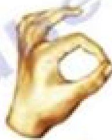
Anterior Interosseous Nerve Injury Patient can not do "O.K." sign