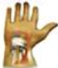
Median Nerve Injury Thenar muscles wasting Numbness in the hand