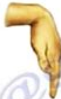
Radial Nerve Injury Wrist drop fracture humerus