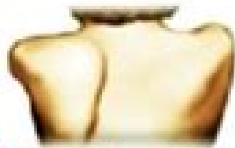
Long Thoracic Nerve Injury Medial winging of Scapula