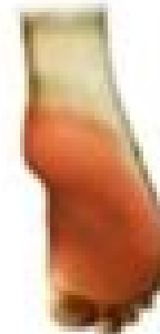
Posterior Tibial Nerve Injury Pain and numbness in the plantar foot and heel