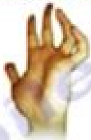
Ulnar Nerve Injury Claw Hand; low ulnar nerve injury; Positive Froment's Sign