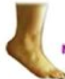
Common Peroneal Nerve Injury Foot drop