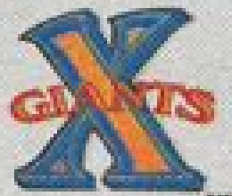
CUBAN X GIANTS