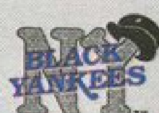
NEW YORK BLACK YANKEES