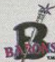
BIRMINGHAM BLACK BARONS