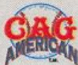
CHICAGO AMERICAN GIANTS