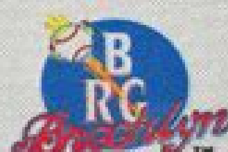
BROOKLYN ROYAL GIANTS