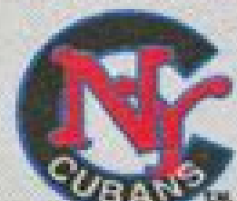
NEW YORK CUBANS