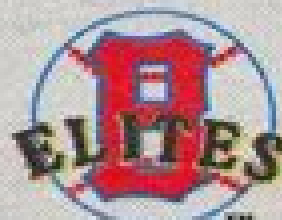
BALTIMORE ELITE GIANTS