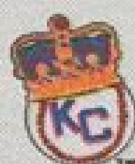
KANSAS CITY MONARCHS