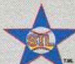
ST. LOUIS STARS