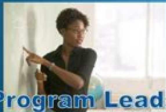
Program Leads & Instructors