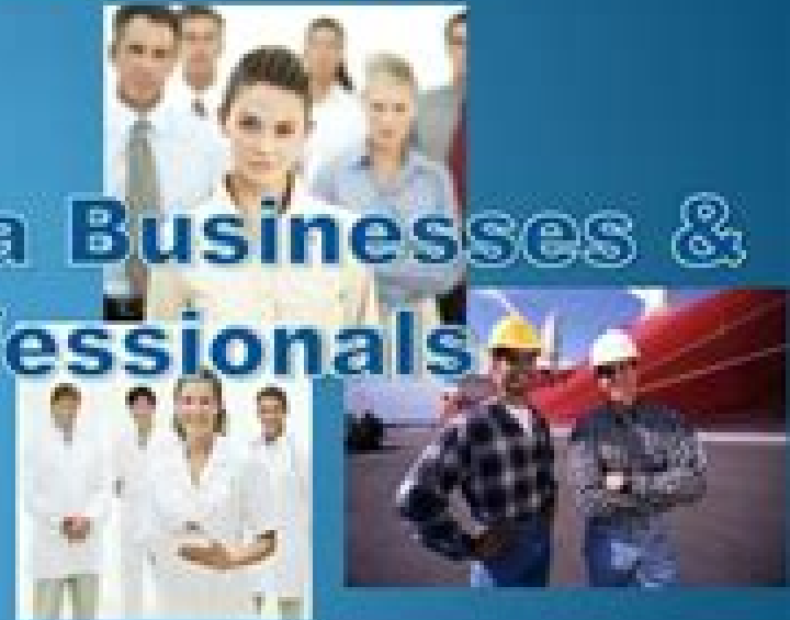
Area Businesses & Professionals