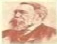
MARX & FREDERICK ENGELS